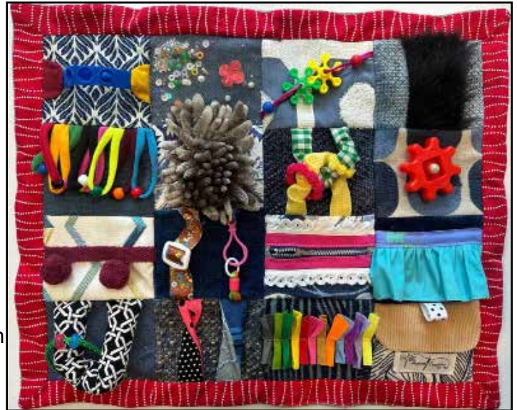
Sample “Fidget” Quilt for children

Members are excited to start 2024 with new quilt projects and hope to have new members join to help with educational but fun projects.