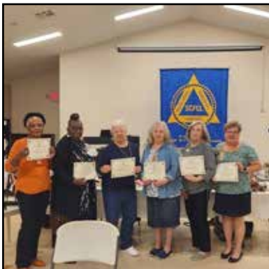
County New Member Certificates