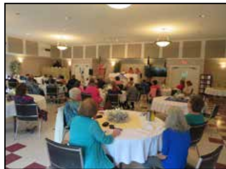
Our Saviour Lutheran Church, West Columbia