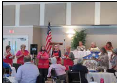
Invitation skit to 2022 Annual Meeting being hosted by Charleston County FCL