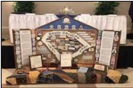
100th Anniversary Display