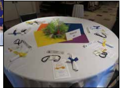
Table decorations for Celebration & Meeting