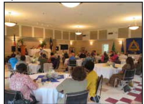
October 12, 2021