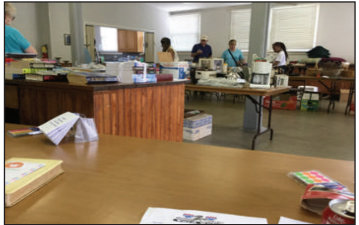
CCFCL i2i yard sale