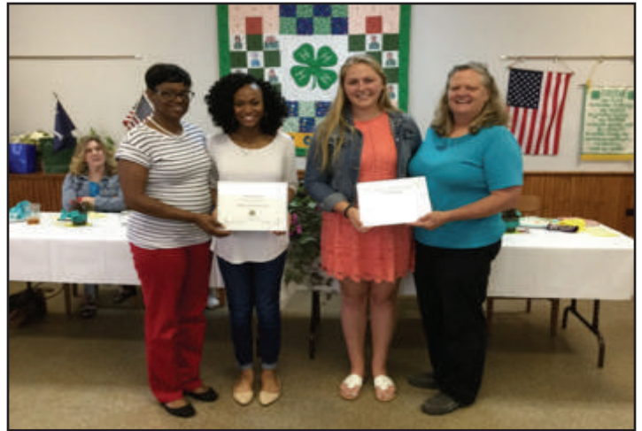
2019 CCFCL Scholarship recipients with their mothers

Also we are hoping to attract new members by distributing brochures that explain our organization and all the opportunities FCL offers.