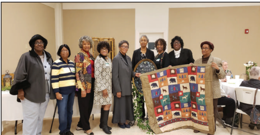
Members of Calhoun County attended the Spring Central District Meeting in Sumter County. Members show a quilt project they have been working on together for the community.