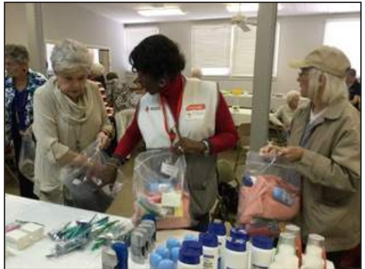
Chester County members Assembling Red Cross Comfort Kits after Spring Council Luncheon.