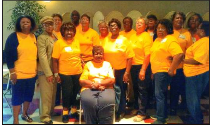
Sixteen Bamberg County members attending Fall Meeting