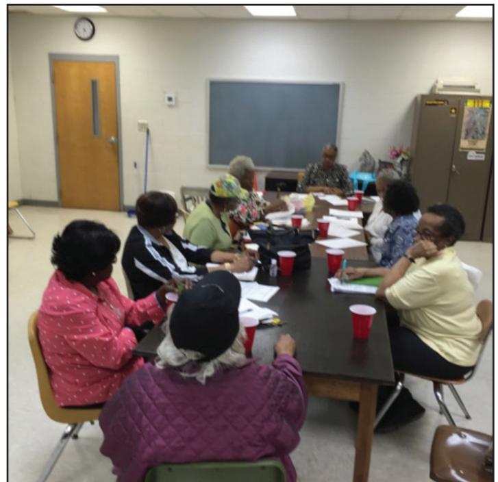
Calhoun County members planning for the year's activities

Calhoun County Family and Community Leaders (CCFCL) members are looking forward to working with the community for the 2017/2018 year.