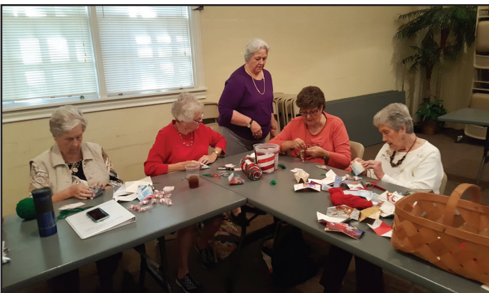
Members prepare Christmas tray favors for Laurens County Hospital & Laurens Memorial Home for the Aged.