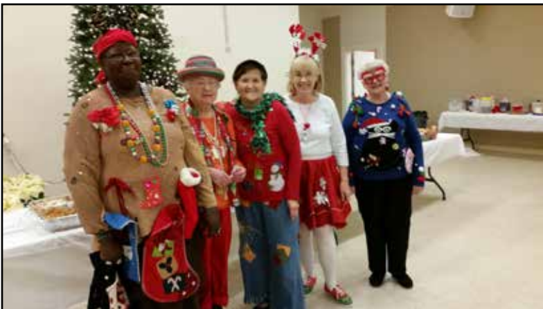
Members in their tacky outfits