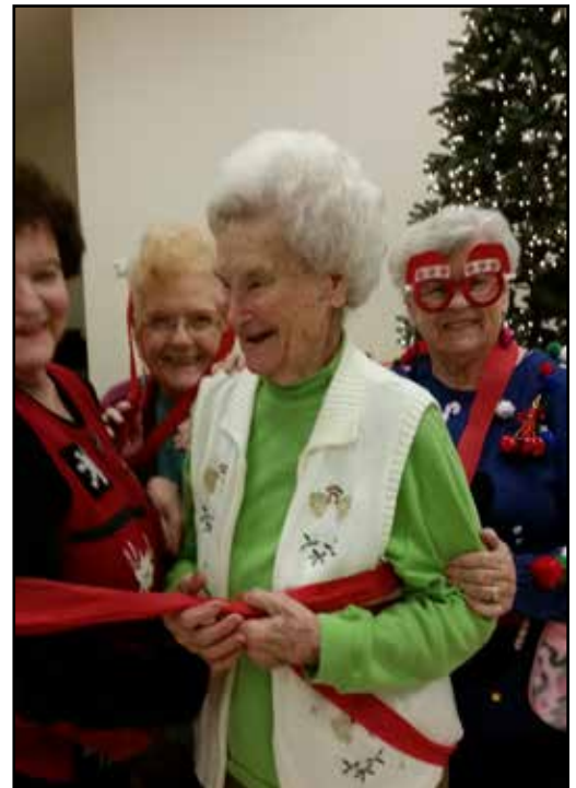
Sumter FCL members playing “All Tied Up”

We decided that 2017’s county project will be a membership drive. Clubs will come up with ideas for attracting new members and share them at council meetings. We are looking forward to a new year and all it will bring.