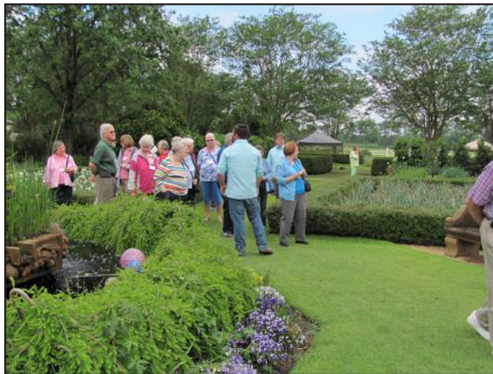
24 members of Lexington County attend the educational tour at the Moore Farms Botanical Gardens in Lake City and the Lake City “Fields of Art”.

In April, a craft class was held with 24 attending, called “Fun With Napkins”. The Herb Bunch Club held their 5 th Annual Herb Festival at the Lexington County Museum and it was a great community event with crafts, food, local vendors, and wonderful plants and herbs. The educational tour was attended by 24 and the destination was the Moore Farms Botanical Gardens in Lake City and the Lake City “Fields of Art.” It was a fun day with a guided tour of the gardens and a chance to make a SC necklace to finish out the day in Lake City. We look forward to seeing all our FCL friends at the State Meeting.