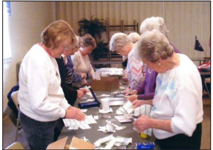
Members of Heirloom Needle Arts prepare tray favors for Laurens County Hospital and Memorial Home.