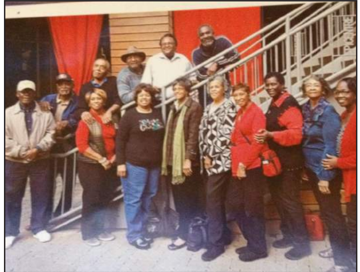
Members of Oakridge Club in Lancaster County

The Oakridge Homemaker's club is still very active with nine members and has been in existence for over 34 years. We are still among the movers and shakers. We look forward to remaining strong in the future.