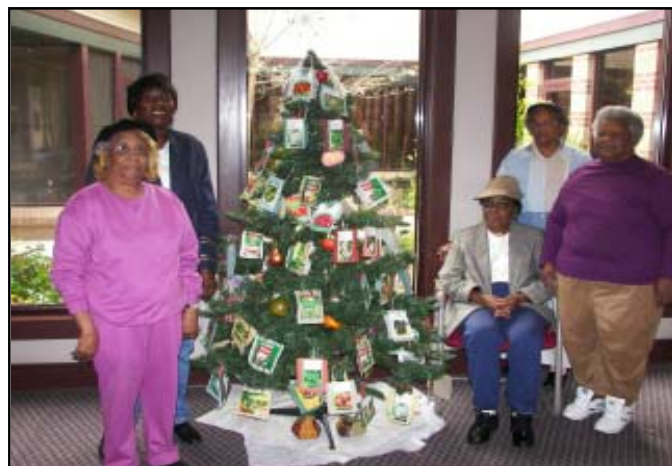
Calhoun County FCL members adopted The Family Health Center and The Mental Health Center and decorated so patients could enjoy the Christmas spirit.

We wish each of you blessings for the Christmas season.