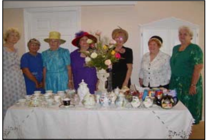
Lee County's Turkey Creek FCL Club enjoy a formal English Tea Party that was taken from the education lesson "Taking Tea with Family and Friends"