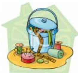
EXHIBIT YOUR FAVORITE HERITAGE SKILLS ITEMS AT THE ANNUAL CONFERENCE IN CLEMSON

Let's not loose those heritage skills our parents, grand parents and great-grand parents handed down. Plan to bring 3 items from each county to be exhibited at the 2008 Annual SCFCL Conference in Clemson