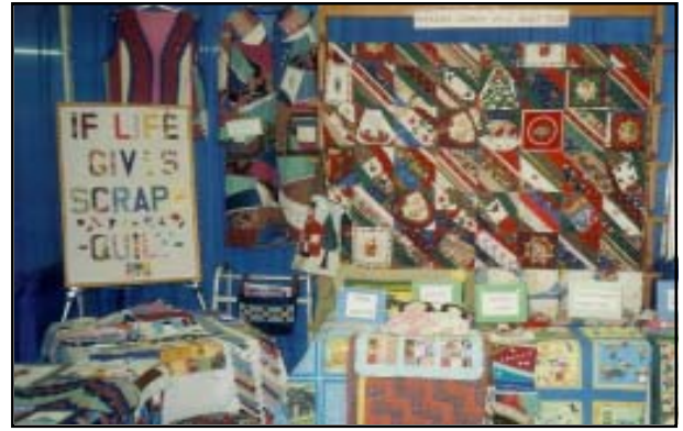
First prize winners by Pickens county FCL members from the Anderson County Fair

The Six Mile FCL Club also assembled 25 kits of fabric and sewing supplies for the NVON Project called "Stitches for Survival". The kits were mailed to Kentucky to help support the "International Disaster Areas" project. The club accomplished its goals for 2007 which included making curtains for the Six Mile Town Hall Community Meeting Room, where the Six Mile Club meets.