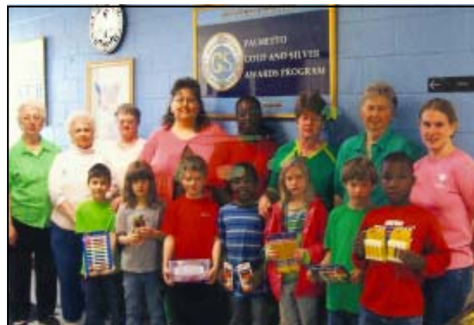
Four Hampton County FCL members formerly Outreach Craft Club members presented school supplies of pencils, glue sticks, Ziploc bags, Kleenex and dry erase markers to first grade teachers and pupils at Varnville Elementary School.