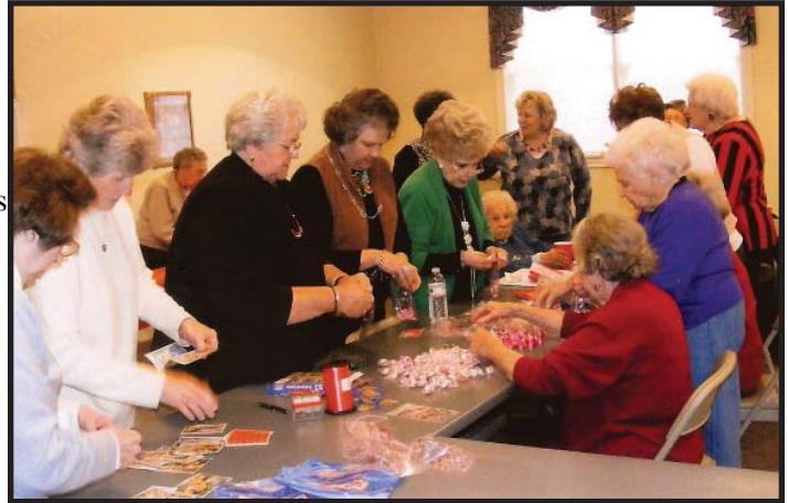
Laurens County's Heirloom Needle Arts members make treat bags for a local nursing home.