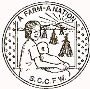
South Carolina Council of Farm Women 1921-1957

DO YOU KNOW YOUR CLUB'S, YOUR COUNTY'S AND YOUR STATE'S HERITAGE?