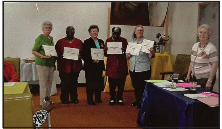
Orangeburg County Leaders of the Year

Our members spent 8,948 hours in volunteer activities with a value of $161,064.00. We received $1,137.20 from our Barbeque Sales and contributed $1,325.00 to community agencies in our county. We increased our donations to ten organizations by $50.00. Another organization that has been receiving $100.00 and will continue to receive this same amount. Three of our members participated in the State Project, "FCL and 4-H Making the Best Better Together" by receiving training to judge 4-H Representations and Record Books. Six of our members participated in regular exercising, some at a Health-Plex Facility and some exercising on their own. One member walks 30 minutes each day, no matter what the weather offers. Another member lost 20 pounds and is real proud of her accomplishment. We continue to strive to promote the best quality of life for all citizens in our communities through dedication, education, and service.