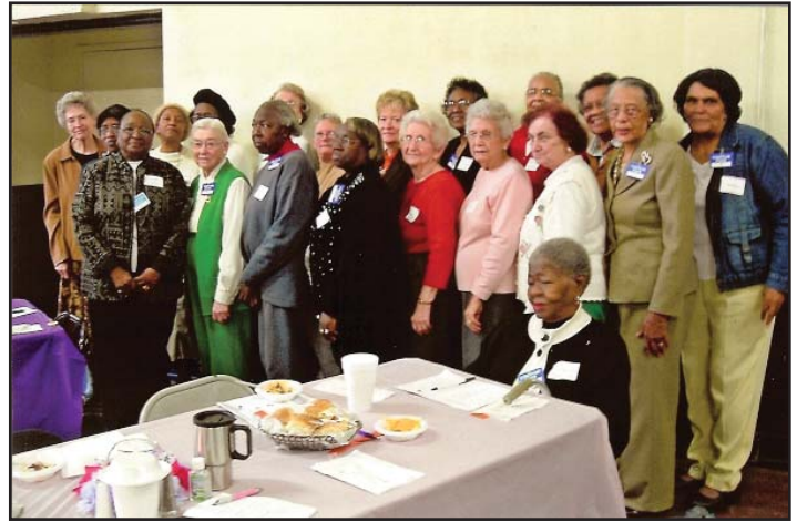
Orangeburg County members attend 2010 Spring Central District Meeting.

Orangeburg County Family and Community Leaders is made up of six clubs. These clubs accomplished much this year and we are looking forward to working hard, enjoying friendships and helping those in need as we go forward to another year.