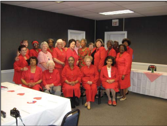
Richland County members wear red dresses to show support for Women's Heart Disease Awareness at Spring Council Meeting.